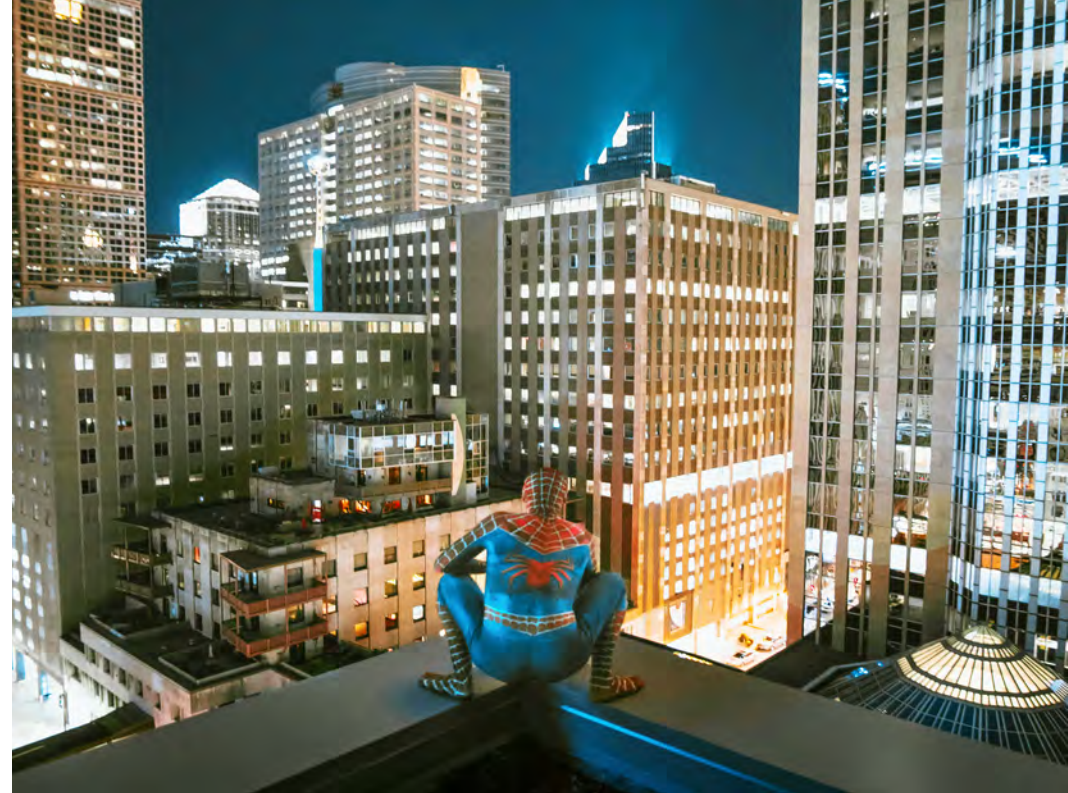
The character of Peter Parker, or Spider Man, goes on a hero's journey much like Odysseus's journey home.

Think of books like Rick Riordan's Percy Jackson and the Olympians , Suzanne Collins's The Hunger Games , or Stan Lee's The Amazing Spider-Man . Each of these stories begins with a character living an ordinary life—until something big disrupts it. Percy finds out he's a demigod and is sent on a quest full of monsters and gods. Katniss is thrown into the deadly Hunger Games and must survive while staying true to herself. Peter Parker starts as a regular teen before a spider bite changes everything. Then he is forced to balance high school with saving lives. Just like Odysseus, these heroes face trials, meeting allies and enemies. They slowly become stronger through their struggles.