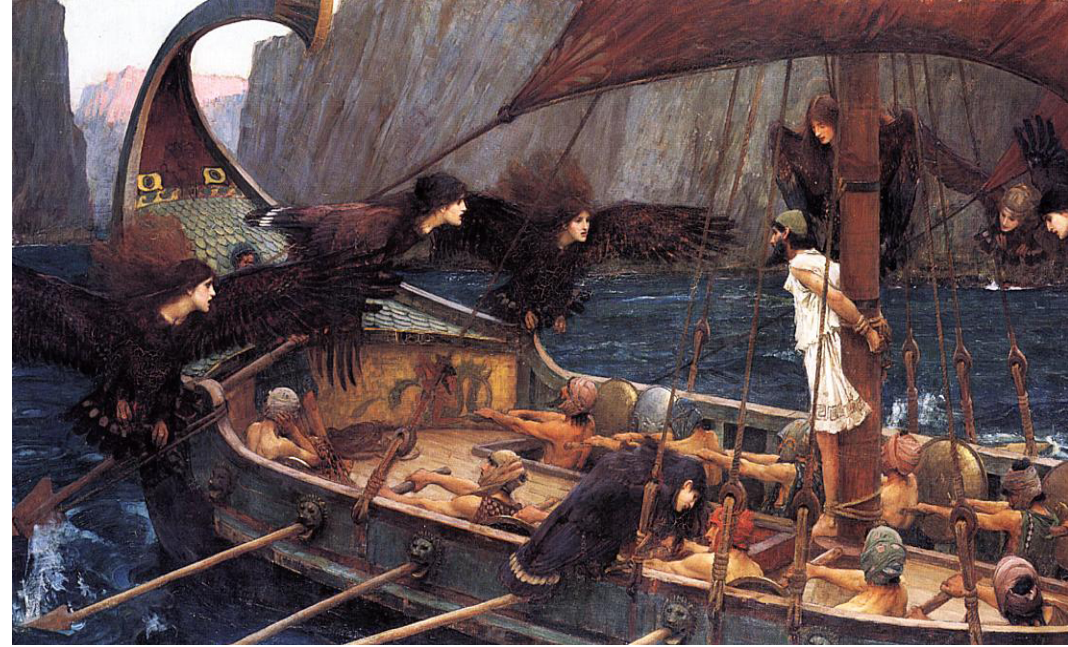
In The Odyssey , Odysseus faces many magical creatures like the sirens.

From there, Odysseus faces one deadly challenge after another. He meets the Sirens, beautiful creatures whose singing drives sailors crazy and makes them crash their ships. He has to sail between Scylla, a six-headed monster, and Charybdis, a deadly whirlpool. His men get turned into pigs by a witch named Circe. He even travels to the underworld to talk to dead people for advice.